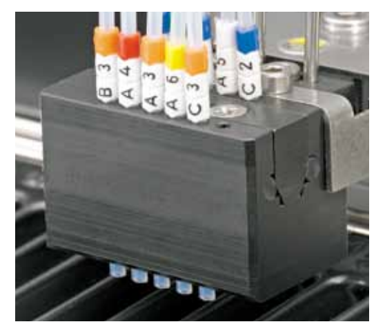
Dispensing & aspirating head.