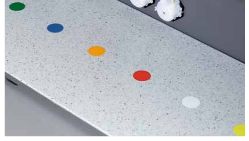
Color-coded reagent positions.

To avoid these problems, the ProfiBlot 48 is equipped with disposable trays only, which have additionally been designed to meet the IVD-Directive 98/79/ EC for Europe.