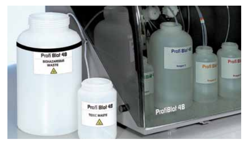
Individual collection of toxic & biohazardous waste.

Western Blot analysis is used in many key applications in clinical diagnostics, such as screening and confirmation of different organisms causing infectious diseases (e.g. viruses or bacteria), and the identification of allergies. Additionally, the introduction of the IVD-Directive 98/79/EC for Europe is setting new standards for a wide range of tests and assays.