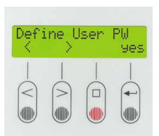
On-board operation via display & keypad.

tious samples. The entire assay is performed in an enclosed environment and thus accidental or unauthorized interference is prevented at every stage during the assay procedure.